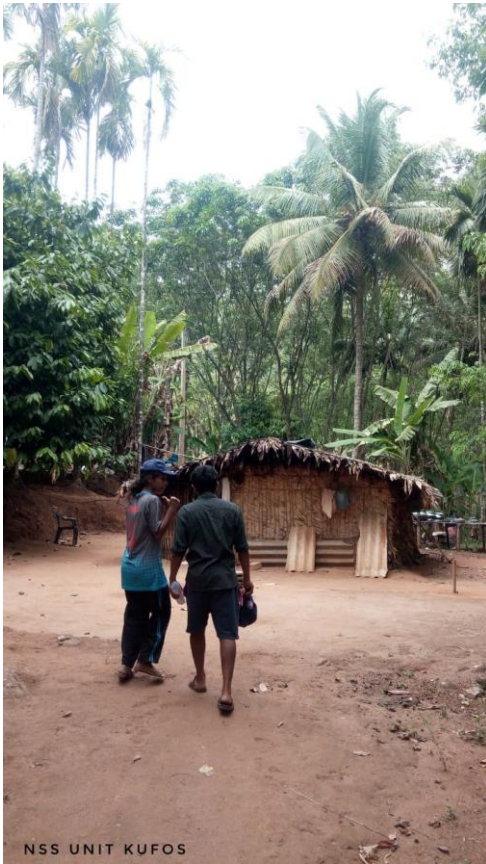
NSS UNIT KUFOS