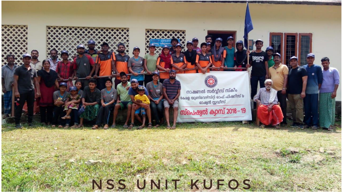
NSS UNIT KUFOS