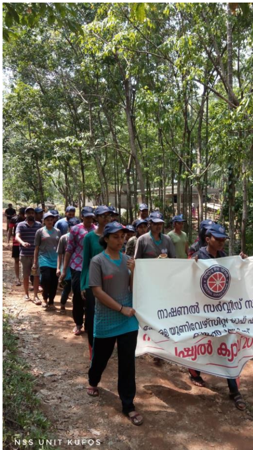
NSS UNIT KUFOS