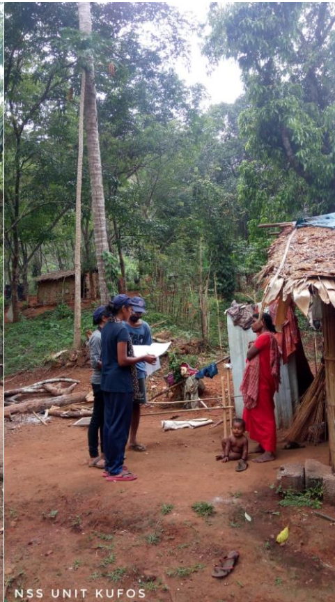
NSS UNIT KUFOS