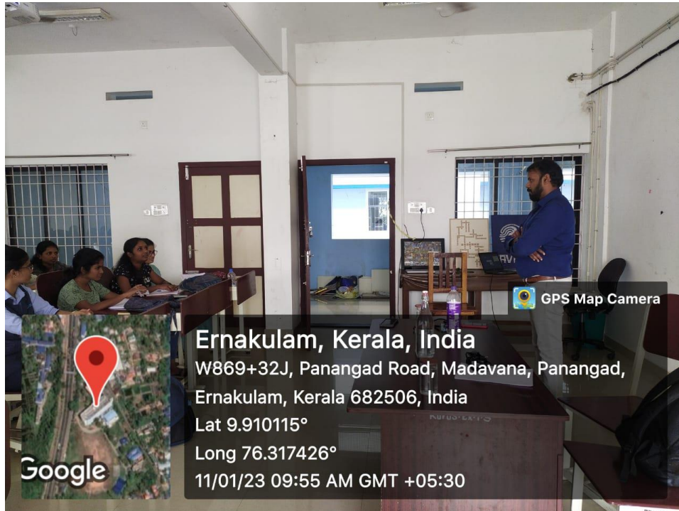
HACCP Class conducted on 09 December 2022