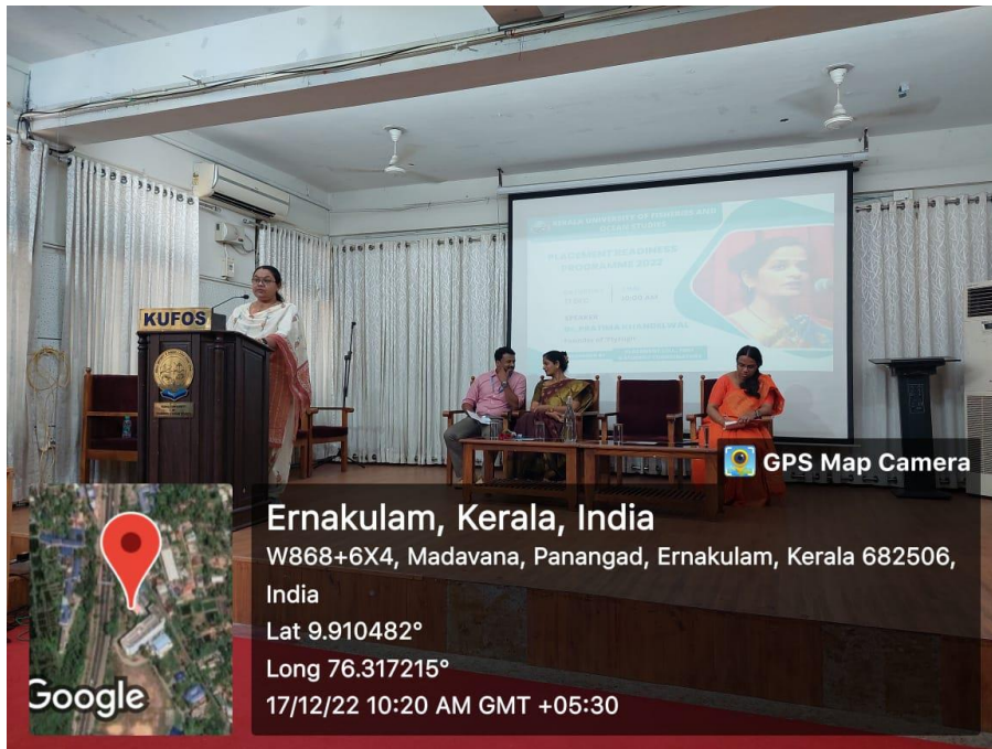
Inauguration of Placement Readiness Programme