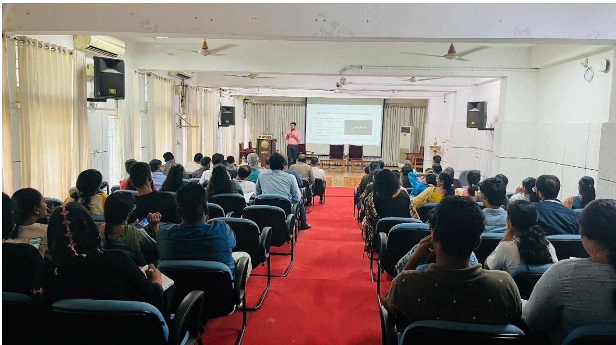
Faculty attending Workshop on AI tools

A series of faculty development programmes were conducted on ICT-enabled teaching, advanced research methodologies, and applications of artificial intelligence. In association with Linnk Academy, Kakanad a one-day workshop on the topic “Leveraging AI Tools for Research & Content Creation for Faculties” was conducted on 8 th August 2025.