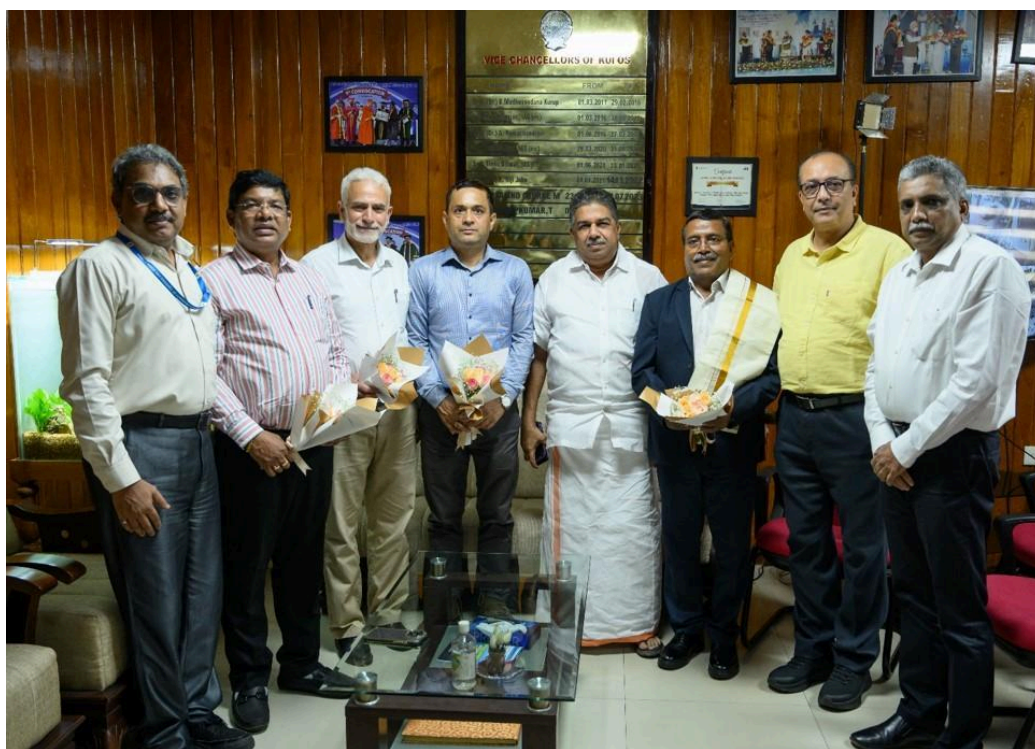
Sri. Saji Cherian, Hon'ble Pro-Chancellor of KUFOS receiving NAAC Peer Team members